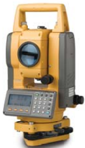
GTS-100N Series Construction Total Stations