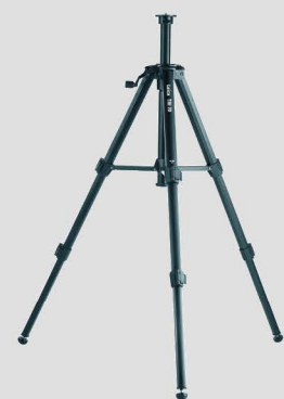
Leica TRI 70 tripod Art. No. 794 963