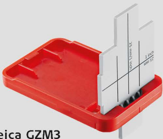
Leica GZM3 target plate Art. No. 820 943