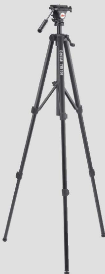
Leica TRI 100 tripod Art. No. 757 938