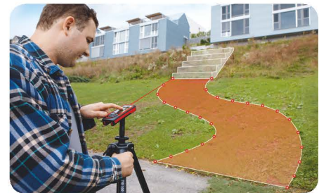
Measuring points and areas