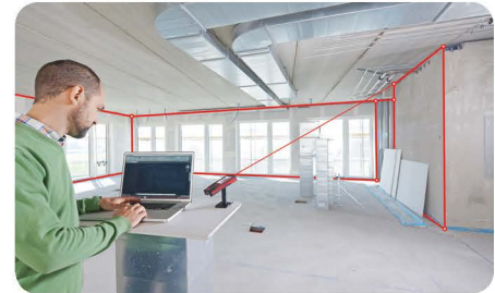
Real-time transfer of point coordinates