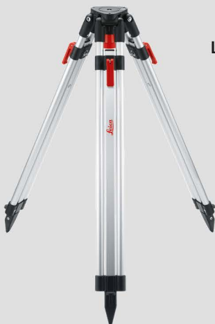
Leica TRI 200 tripod with 1/4" thread Art. No. 828 426