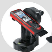
Leica FTA360-S adapter Art. No. 828 414